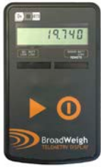
BW-HR Handheld Wireless Display LCD reading from an unlimited number of BroadWeigh shackles