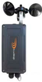
BW-WSS Anemometer Wireless wind speed sensor