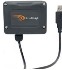
BW-BSue Extended range wireless radio telemetry USB Base Station