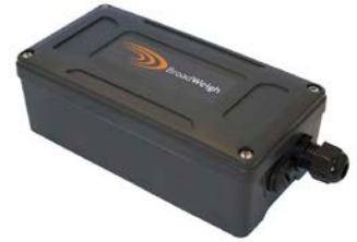
BW-AR Active repeater to extend wireless range or coverage